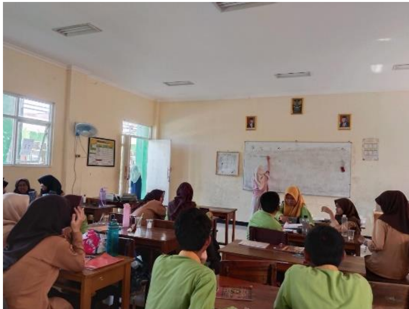
Figure 2. The Teacher Formulates a Problem Regarding the Topic

After that, the teacher continues the second stage, namely “Problem Statement” where students are guided to identify the level of difficulty of the topic by providing several problem formulations.