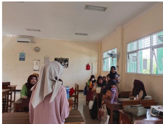
Figure 1. The Student Describes the Pictures

Syah (2004) outlined six steps for implementing Discovery Learning, with the first being the “Stimulation” stage. At this stage, the teacher introduced the strategy and presented students with pictures, prompting them to describe what they observed.