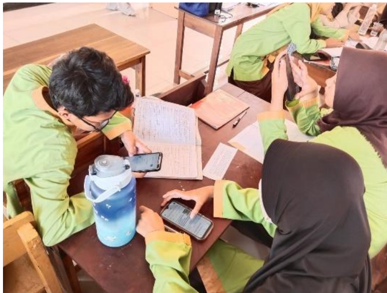
Figure 3. The Students Collect Data through Various Sources

Then, the teacher conducts the third stage in this strategy, namely “Data Collection” by forming 6 groups of 3-4 students to gather relevant information from various sources to test their hypotheses.