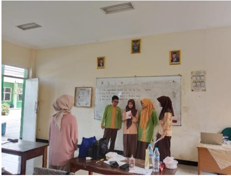
Figure 5. The Students Present Their Findings