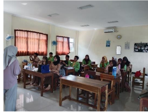
Figure 6. The Teacher Provides an Explanation Related to the Topic

Students' experiences at this stage showed that they felt more confident and supported in evaluating the results of their discussions. During group presentations, students had the opportunity to clarify their understanding and confirm if the answers they found were correct. This was because, after the presentations, the teacher immediately provided feedback related to the descriptive text material. This is evident in figures 5 and 6 above. Students also expressed that “Strategi ini bermanfaat dalam meningkatkan berani tampil di depan untuk presentasi.” The teacher further supported this, saying, “...mereka aktif berdiskusi dengan kelompoknya sebelum di tahap verification mereka mempresentasikan hasilnya, hal ini meningkatkan kemampuan siswa dalam mengkomunikasikan ide, memperkuat pemahaman mereka, dan meningkatkan keterampilan presentasi mereka.” The verification stage helped solidify students' understanding and supported their development in presentation skills.