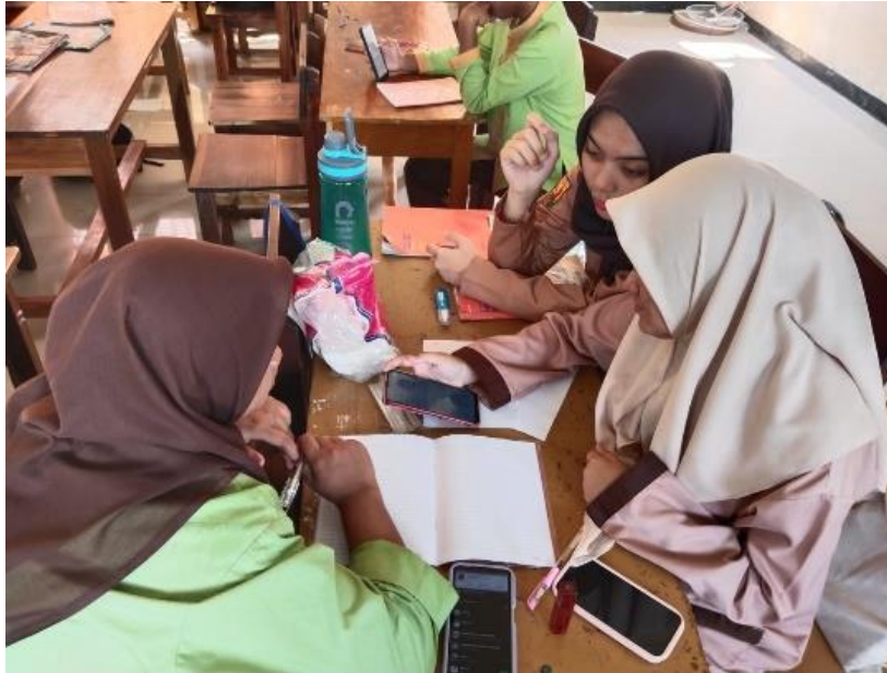
Figure 4. The Students Process the Data that Has Been Collected

Based on observations, students' experiences at this stage showed that they actively engaged in analysis, discussion, and sharing ideas during group activities related to the descriptive text. One student stated, “Menurut saya strategi ini membantu dalam memahami bacaan teks deskriptif tadi karena strategi ini kan berkelompok ya, jadi kalo ada temen yang belum paham bisa didiskusikan masalahnya, dimana yang belum paham sama dimana yang udah paham. Jadi bisa saling bantu.” This was reinforced by the teacher, who highlighted the students' behaviors and mentioned, “Menurut saya siswa terlihat senang karena melalui diskusi, mereka bisa lebih bebas bertukar pikiran dan menyampaikan ide-ide mereka dengan anggota kelompok.” Students actively engaged in meaning-making through group discussions.