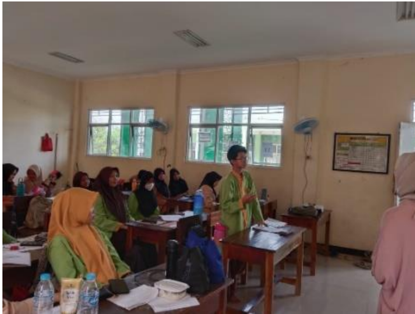
Figure 7. The Students Conclude the Material that Has Been Learned

Students' experience at this "Generalization" stage shows that they feel more confident in concluding the material that has been learned. They felt that they better understood the concepts that had been discussed through previous discussions and presentations. One student stated, " Setelah diskusi dan presentasi, saya lebih paham dan bisa menyimpulkan materi dengan lebih mudah. " This is also supported by the teacher's statement who said, " Siswa terlihat lebih percaya diri dalam menyimpulkan materi setelah mereka melalui tahap berdiskusi dalam kelompok dan presentasi dalam tahap verification. " Therefore, it can be concluded that the generalization stage helped students strengthen their understanding, foster their ability to independently infer information, and solidified their grasp of the material.